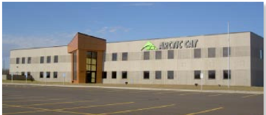
Arctic Cat, St. Cloud, MN

A s Arctic Cat was looking for a new location to build their ATV Engine Plant, they were able to narrow their selection between St. Cloud, MN and another site in the Midwest. Their final selection became St. Cloud due to a number of factors including a well trained and sizable labor force; St. Cloud was on the supply chain delivery route for their main plant in Thief River Falls and proximity to their main headquarters. After they made this decision, Arctic Cat selected a number of local contractors to discuss proposals of how each contractor might help them in designing and building this new facility. Through that process, Winkelman Building Corporation was selected based upon their design/build delivery system and construction began in the spring of 2006. The building consists of a 60,800 square foot manufacturing floor with an additional