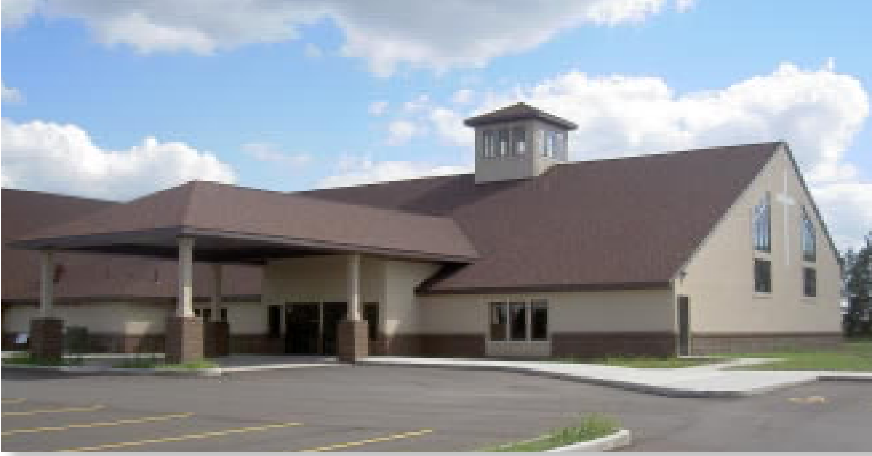
Rejoice Lutheran Church, Clearwater, MN

Winkelman constructed an educational wing in 1996, and now, with the assistance of Mahler and Associates Architects of St. Cloud, engineered the creation of approximately 8,800 square feet of new worship space and a large serving kitchen. The new sanctuary is sprinkled for fire protection, a state-of-the-art audio visual system was installed with two large projection screens and the entire new space is air conditioned.