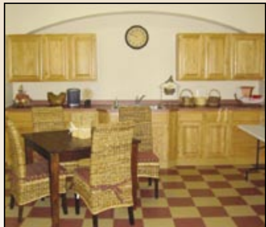
Traditions Care Facility Owatonna, MN