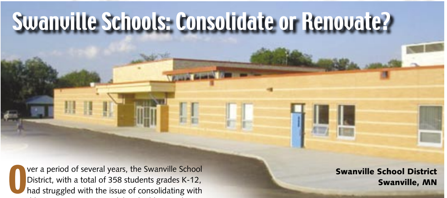
Swanville School District Swanville, MN