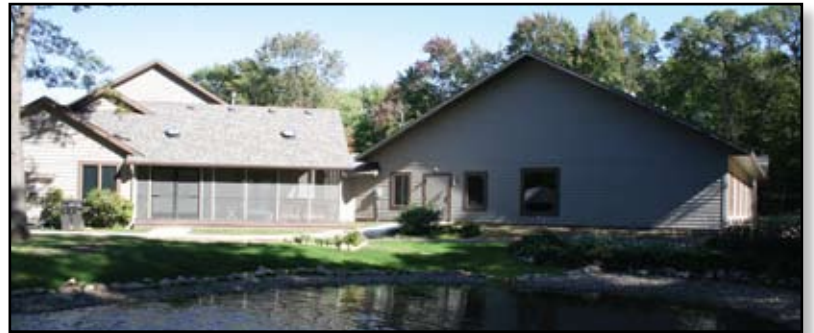
Quiet Oaks Hospice House St. Cloud, MN