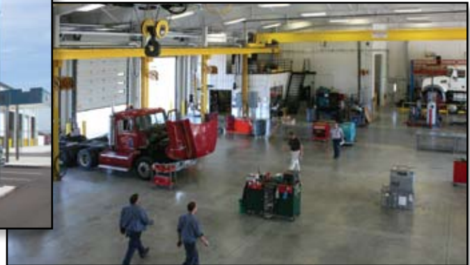
Nuss Truck & Equipment St. Cloud, MN

of the art lube pit and a wash bay and a special work bay designed to accommodate oversized heavy construction vehicles.