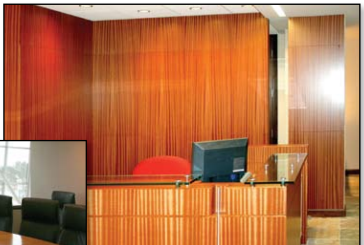
Gray, Plant, Mooty St. Cloud, MN