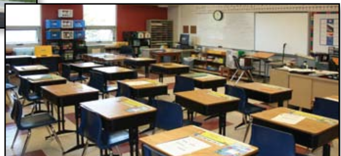
Lake Benton School District Lake Benton, MN

removed a 1922 building, a dilapidated swimming pool and an old fuel oil powered boiler, all with high operating costs, and replaced them with new energy efficient classrooms and a new geothermal heating and cooling system. 🌱