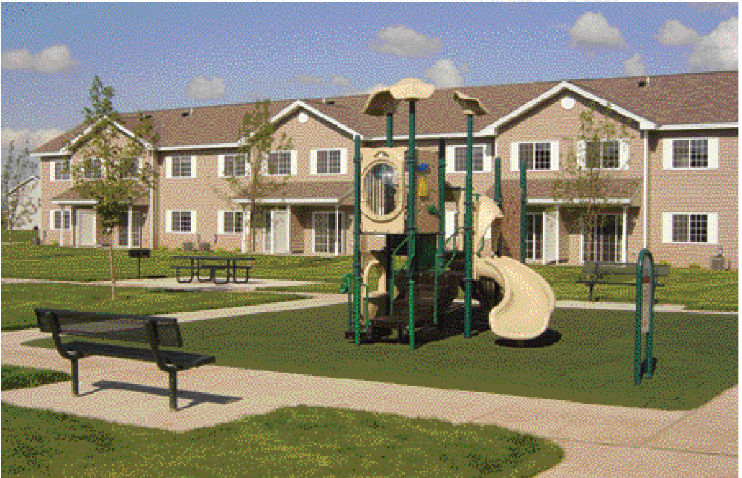
Pheasant Crest Townhomes Sartell, MN