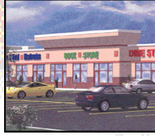
Winkelman Building Projects Underway