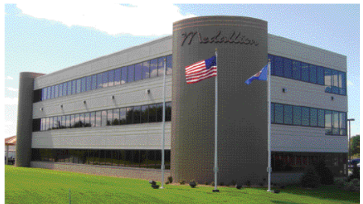
Medallion Cabinetry, Waconia, MN

M edallion Cabinetry, a rapidly growing cabinet manufacturer and a subsidiary of Elkay Manufacturing, recently celebrated the completion of their three-story office building located in Waconia, MN. The modern new building provides over 25,000 square feet of office set in a beautiful, yet functional, location. Project Manager Ralph Brown outlined some of the challenging aspects of the project, "We struggled with difficult winter weather for the masonry and steel phases of the construction. I know we were successful, however, because we satisfied all of our client's needs." The building design was provided by Dan O'Brien of Cluts, O'Brien, Strother