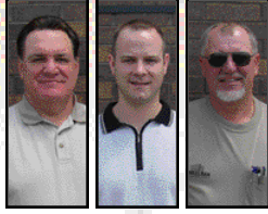
New Talent Joins Winkelman