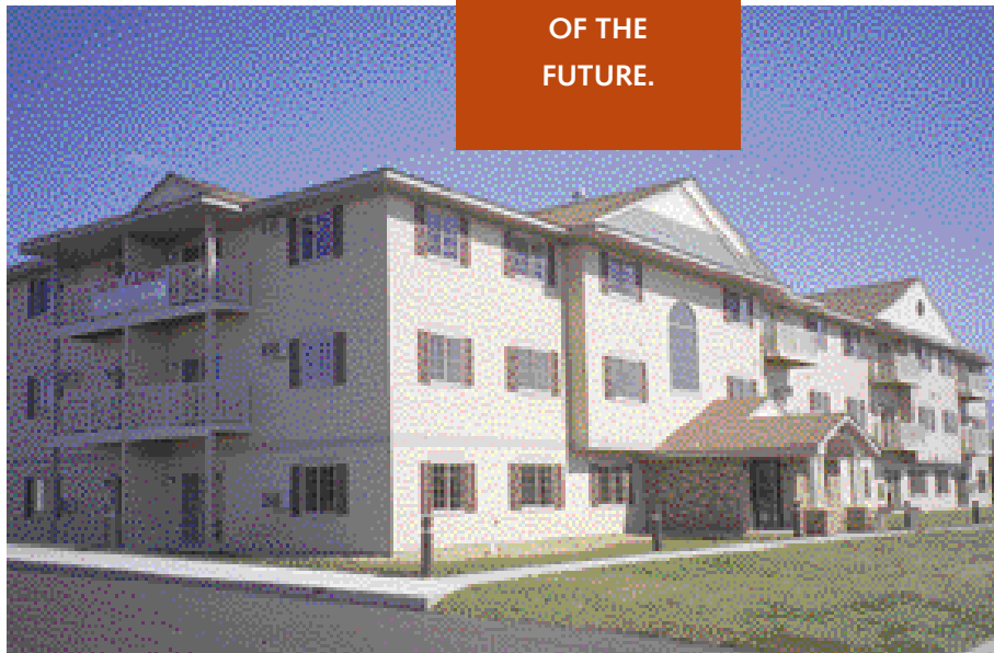
Skyline Vista Apartments, Granite Falls, MN

PANELIZATION IS NOT A FAD, BUT A WAVE OF THE FUTURE.