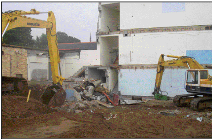
Demolition at Swanville Public Schools, Swanville, MN

THE SOLUTION: Out with the old and in with the new...as well as cosmetic upgrades, re-roofing, mechanical upgrades and fire protection additions to the remaining portions of the building.