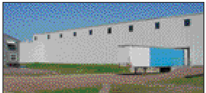
Mille Lacs Wild Rice, Aitkin, MN

project is that it was one of the first JOBZ construction projects in the state and the first of several for WBC. ✦