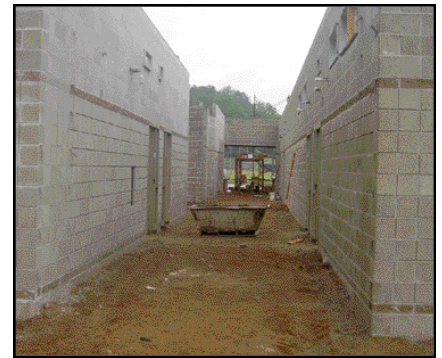
Concrete construction underway

THE CHALLENGE: Conduct demolition of the old building and temporary classrooms and construct a new 9,000 sq. ft. elementary portion and mechanical room in a period of three months for occupancy this school year. We also are implementing the tuck-pointing, re-roofing and remodeling of the auditorium and gymnasium during this short time period. Following completion of this phase, we will be constructing a 16,000 sf commons area, locker rooms, weight room, concession stand and office portion of the building during the school year, followed by cosmetic upgrades of paint, lighting, ceiling tiles and lockers next summer.