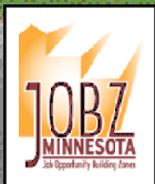
Medallion Cabinetry Door Plant New Ulm, MN