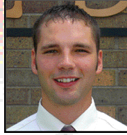
New Talent Joins Winkelman