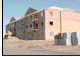
Why Building Costs are Soaring at Rapid Rates